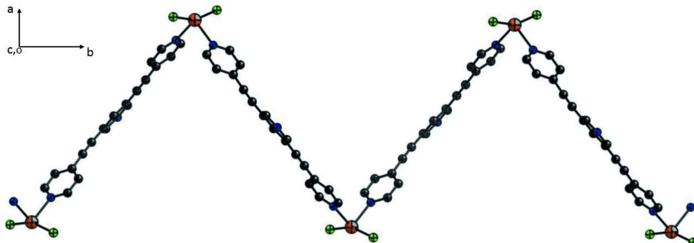
Figure 2 A view along the b axis of the zigzag chain structure of the title coordination polymer. Displacement ellipsoids are drawn at the 50% probability level, and H atoms have been omitted for clarity.

The organic ligand 3,5-bis(pyridin-4-ylethynyl)pyridine ( L ) was synthesized from the reaction between 3,5-dibromopyridine and 4-ethynylpyridine hydrochloride following the reported procedure (Yamamoto et al. , 2003). To synthesise the