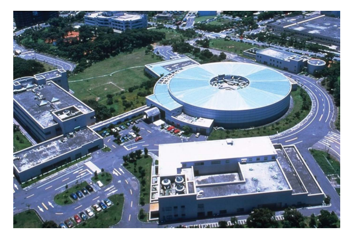
National Synchrotron Radiation Research Center of Taiwan with the new Taiwan Photon Source.

The Board of Trustees of the National Synchrotron Radiation Research Center (NSRRC), Taiwan, is seeking a Director to lead and