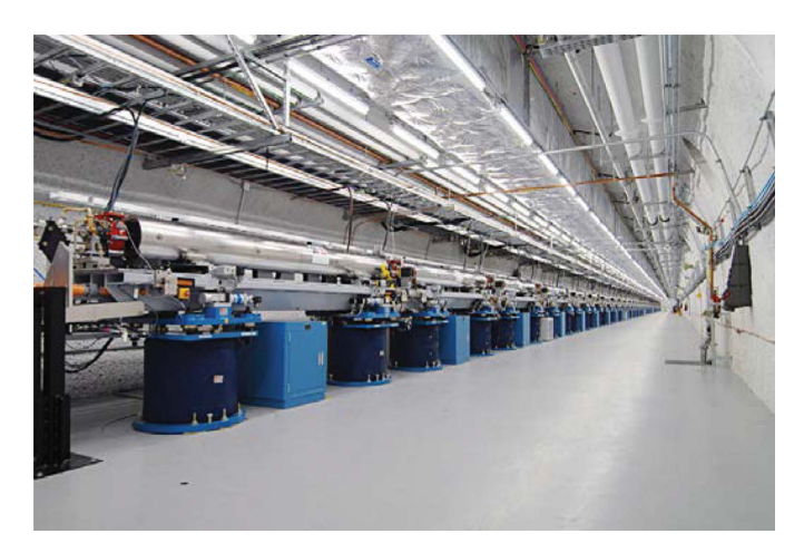
LCLS undulator tunnel.

unfunded proposal will require the coordinated efforts of a number of laboratories, but represents 'an exciting project which will transform SLAC as a site and as a laboratory'.