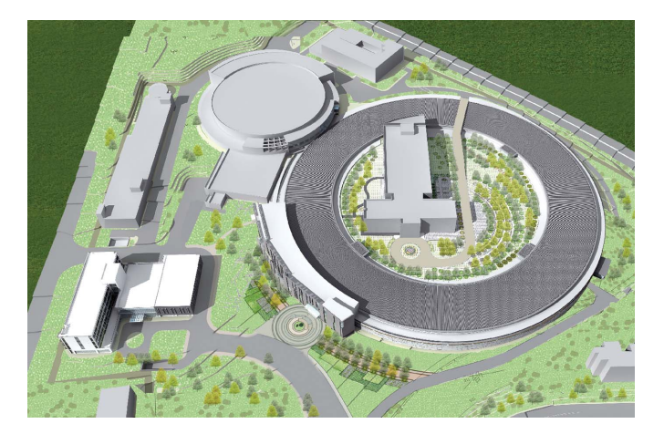
An aerial view of the 1.5 GeV TLS (ring on the left) and 3 GeV TPS (larger ring) at NSRRC. The TPS building will go around the current office/lab building of NSRRC.

Both of these facilities will be co-located with clear possibilities of upgrade for TLS when TPS is in full operation. We note that very few