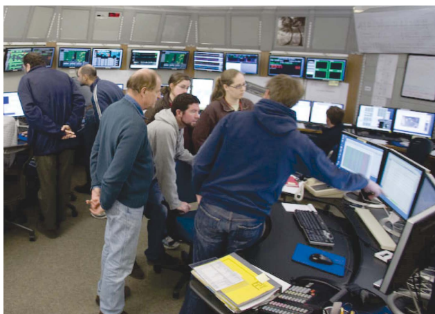
LCLS staff in the control room.

When the LCLS is completely up and running, the electrons will encounter undulators as they travel through the undulator hall. Where now the electron beam travels unimpeded through the undulator hall, these magnets will force the beam to wiggle ever so slightly side-to-side. These wiggles cause the beam to emit X-rays,