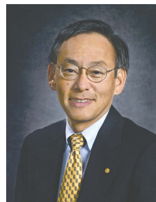
Steve Chu.