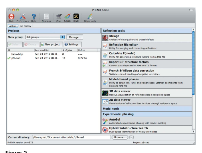
Figure 2 Screen capture of the main window of the PHENIX GUI running on a Macintosh computer.

An essential feature of collaborative development, or any long-term software project, is frequent testing of all basic functionality to guard against bugs introduced by code changes. In the context of PHENIX and the cctbx (Adams et al. , 2010), this is primarily accomplished by running nightly builds and a set of regression tests on all supported platforms. Automated testing of graphical code is notoriously difficult because of the interactive nature of the software. However, careful separation of core logic and presentation allows the