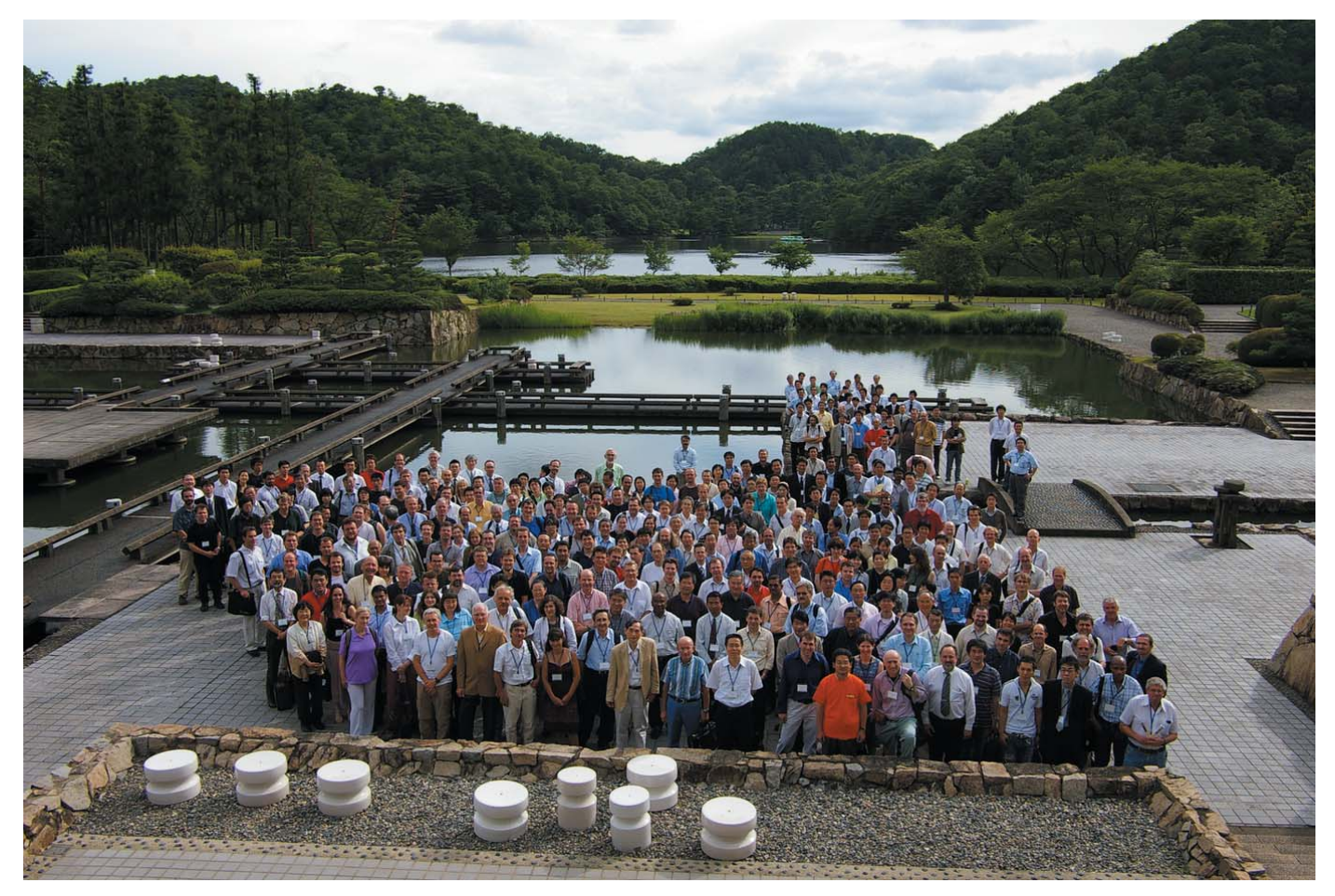
Figure 1 SAS2006 participants during a break from the meeting.

magnetic materials and superconductors; noncrystalline materials; surfaces and interfaces; grazing-incidence smallangle scattering; theory and modeling; and fibre diffraction. The special sessions covered topical research of an inter-