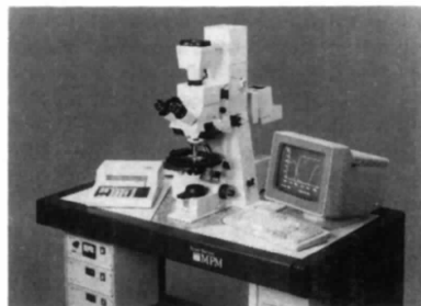
Carl Zeiss MPM 400/800 microscope photometer

Carl Zeiss introduces two new microscope photometer systems, the MPM 400 and the MPM 800 , which are all-purpose high-resolution instruments for all applications of microscope photometry in research and routine. The wide spectral range from UV to NIR — 240 nm to 2100 nm (MPM 800) — and the resolution in the highly dynamic measuring range allow very precise measurements far beyond the possibilities provided by TV image analysis.