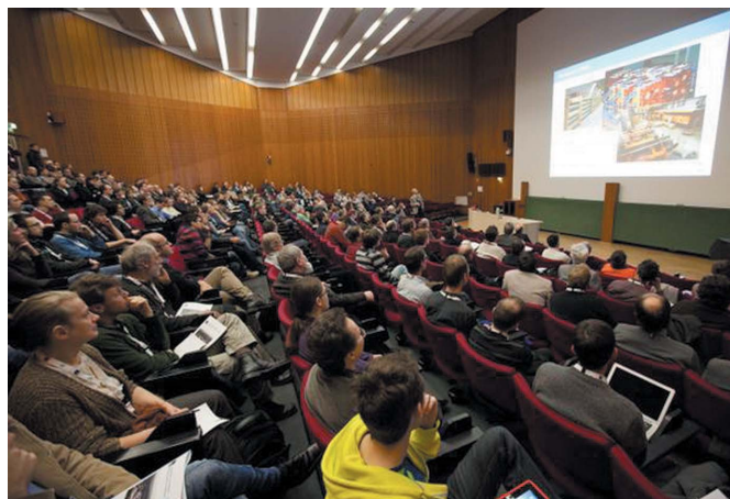
2013 Crowd at the DESY and European XFEL users’ meeting.