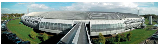
Diamond Light Source.

versary celebration of science driven by Diamond Light Source, the UK's national synchrotron science facility. Science highlighted included studies of cell signalling systems, studies into the electronic function and structure–function relationships in catalysts, the design and discovery of carbon capture materials, studies of pollutants and a detailed series of structures for the EV71 virus responsible for hand-foot-and-mouth disease. Professor Gerd Materlik, Diamond's Chief Executive, commented, "Today is about showcasing the world-class research that amazingly talented scientists are delivering with the help of our machine and our in-house expertise. As new facilities become available at Diamond, we are able to attract researchers from an ever-increasing number of scientific disciplines. Phase III's ten additional beamlines will further enhance Diamond's ability to support UK science and industry and contribute to economic growth."