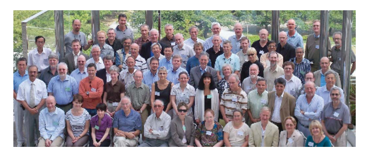
Delegates of the Commission on Journals during their meeting in Osaka.

A detailed report on the commission meeting is given at http://www.iucr.org/news/meeting-reports/21st-iucr-congress/commission-on-journals-satellite-meeting.