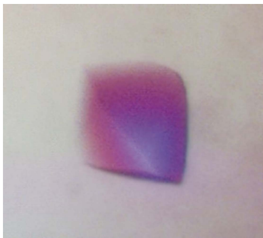
Figure 2 Crystal of Sso6206.

6 mg ml -1 as measured by Bradford assay. The identity and integrity of the protein were confirmed by mass spectrometry (University of St Andrews).