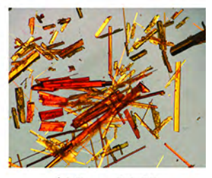
(e) Forms I & III