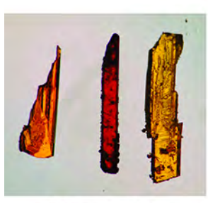
(b) Forms I, II & III

(a) (2-aminopyridinium)·(9-anthracenecarboxylate)·(trinitrobenzene)