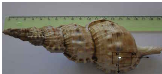
Figure 1a: The Ranella olearia shell.