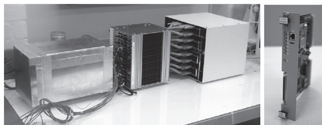
Fig. 1 Detector unit for BL03 iBIX diffractometer (left) and a new data acquisition electronics with a GbE port (right).

Now we’re working on the upgrades of those systems and we have developed bright but short-lifetime and low afterglow scintillator, high efficient light-guide system, a new encoder module with a new position-analysis program on FPGAs, and DAQ electronics with a giga-bit Ethernet port. In case of software, we have made our iBIX programs to a new shared library generally used at other instruments. The library includes control of the electronics, data acquisition, data logging, and online analyses, and it can be used from C++ programs or Python scripts on Linux (RHEL clones, Ubuntu), Windows, and Mac OS X. We will install those upgrades to the instruments at J-PARC during 2012.